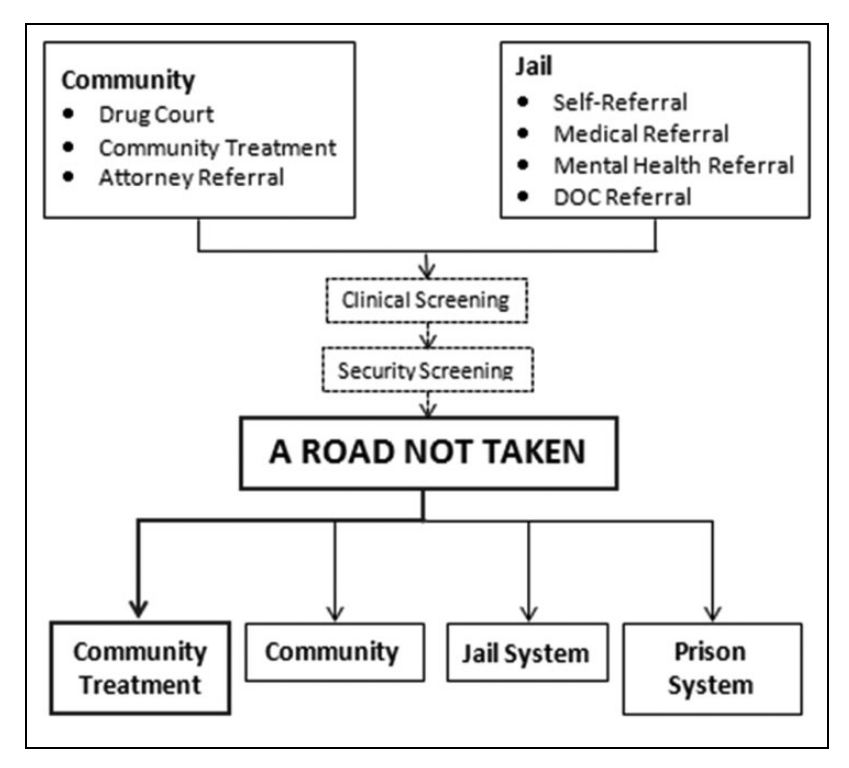
Figure 1. Program pathway. A Road Not Taken offers an alternative to the traditional outcomes of continued incarceration or release to the community without adequate preparation for treatment.

mental health care in the NYC jail system. Approximately half of inmates self-report substance use at intake, although this statistic is often considered an underestimation in light of drug-related charges ranking among the most common charges (NYC DOC, 2012). Research indicates that 80% of inmates are involved with drugs by collateral charge or self-report at admission (van Olphen, Freudenberg, Fortin, & Galea, 2006).